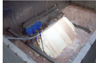
Waste frozen ice cream entering the pump hopper.

Please visit www.seepex.com for further information and contacts.