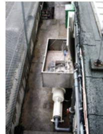
seepex BTH range pump mounted outdoors against the wall of the production area.