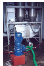
seepex macerator cuts the salmon to final size.