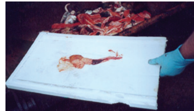
Salmon before chopping.

For Kilkerrin Salmon it has meant an enviable double. Not only have some of their operating costs been halved, but the elimination of offensive spillages and gentler cleaning processes has brought environmental gains to this beautiful part of Ireland.