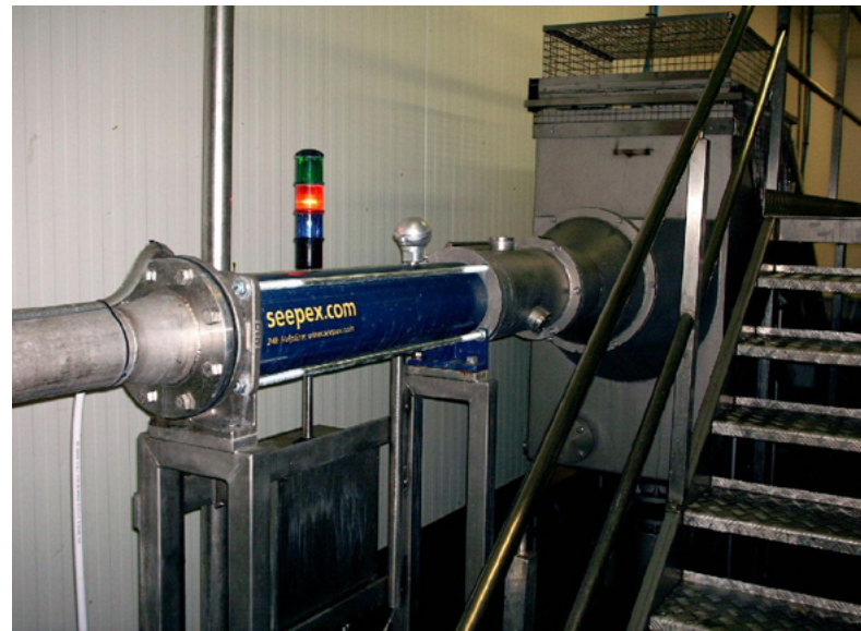
seepex BTM pump with integral stone trap and cutting knives handles waste vegetables, replacing both widethroat pump with grinder and the screw conveyor

Starting with a blank canvas the seepex project team analysed the waste removal operation and put together a turn-key package for the customer. This package involved design, supply, installation and commissioning of a full waste transfer and dewatering system.