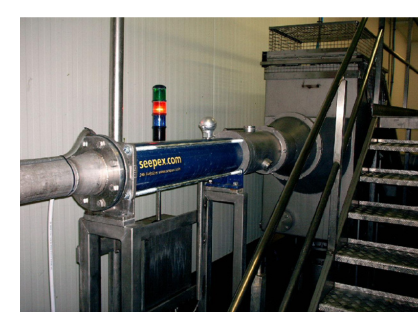
seepex BTM pump with integral stone trap and cutting knives handles waste vegetables, replacing both widethroat pump with grinder and the screw conveyor

Starting with a blank canvas the seepex project team analysed the waste removal operation and put together a turn-key package for the customer. This package involved design, supply, installation and commissioning of a full waste transfer and dewatering system.