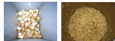
Potatoes before and after macerating and transportation.