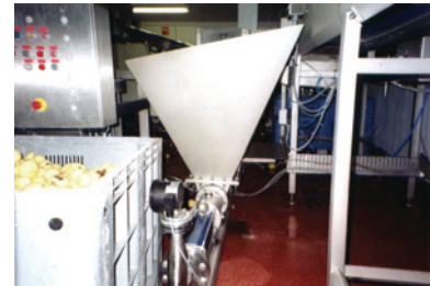
seepex BTM range pump with open hopper.

As the site project engineer commented. "Now we hardly have to handle the waste at all - and we've got a closed pipeline system instead of our open conveyors. What a truly smashing idea!" The seepex system has also brought them less mechanical break-downs and a reduction in the bulk of the waste through the particle size being reduced, so lowering the overall cost of waste disposal.