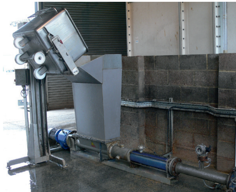
seepex BTM range pump receiving waste from a tote bin

A seepex BTM pump with extension hopper, integral knives and control panel was installed and the waste from the site is tipped into this pump which chops it before pumping to a large storage tank. This waste is collected by tanker in 20 tonne loads and taken to a local anaerobic digestion plant where it is converted to biogas and soil improver.